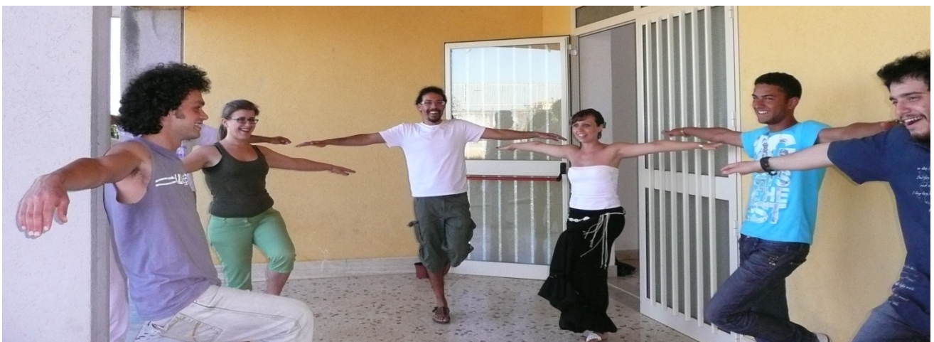
IMG 11: Theatre Workshop