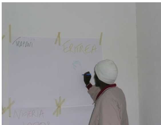
IMG1: First Workshop