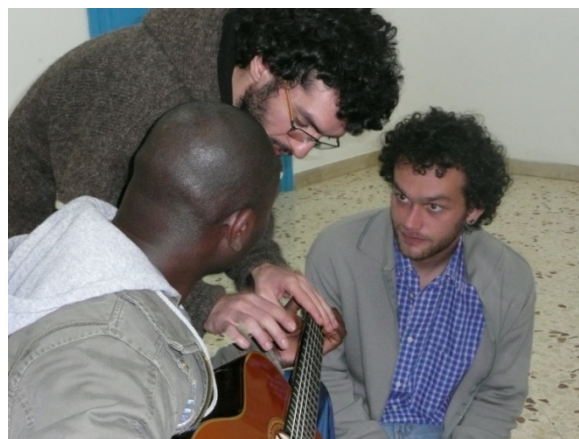
IMG2: Music Workshop