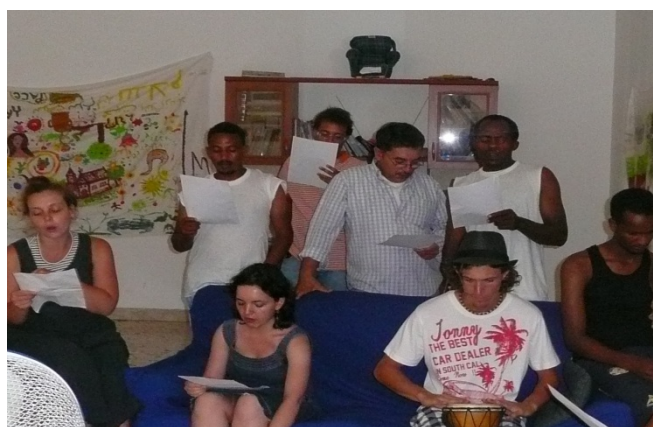
IMG 5 e 6: Music Workshop